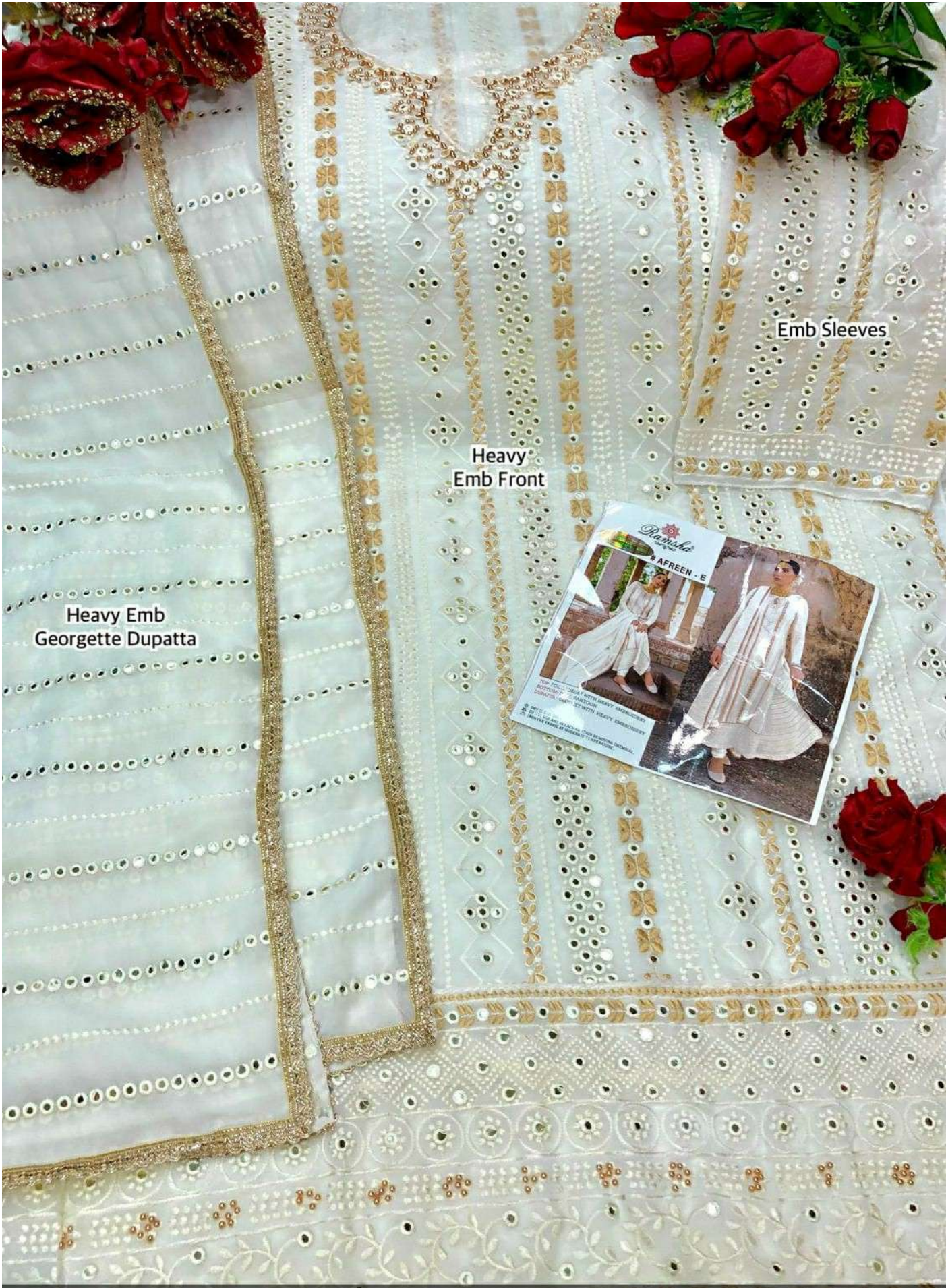
Heavy Emb Georgette Dupatta