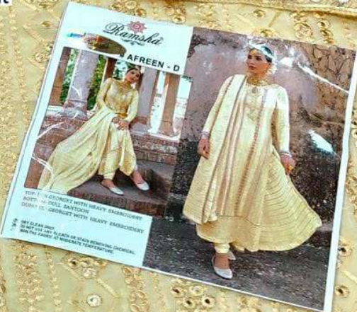
FOR: 11 - GEOMETRIC WITH HEAVY EMBROIDERY NOTE: 11 - 2014 BANTON NOTE: 11 - GEOMETRIC WITH HEAVY EMBROIDERY FOR: 11 - GEOMETRIC WITH HEAVY EMBROIDERY NOTE: 11 - 2014 BANTON NOTE: 11 - GEOMETRIC WITH HEAVY EMBROIDERY